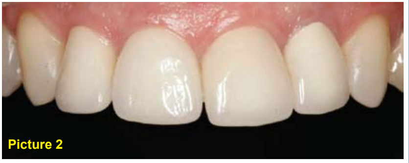
Patient who presented with crowns of incorrect color match.

The following are pictures of patients who presented to our office in need of cosmetic corrections.