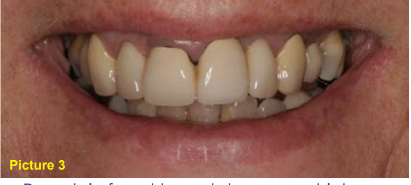
Porcelain fused to metal crowns which are opaque, and show grey lines at the gum line.

Call Advanced Cosmetic and General Dentistry And Let Us Help You Put A Smile Back On Your Face!